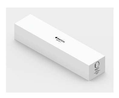
Apple Watch Series 3 (GPS) retail packaging contains at least 39 percent recycled content.